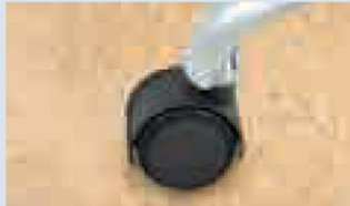
For use on linoleum (vinyl): Order soft wheel casters.