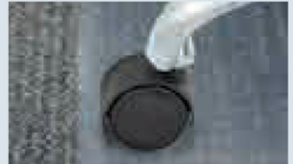
For use on chair mats: Order soft wheel casters.