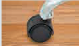
For use on hard floors: Order soft wheel casters.