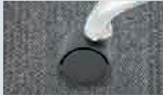
For use on carpeting: Order hard wheel casters.

For hard floors, linoleum (vinyl) or chair mats: order soft wheel casters.